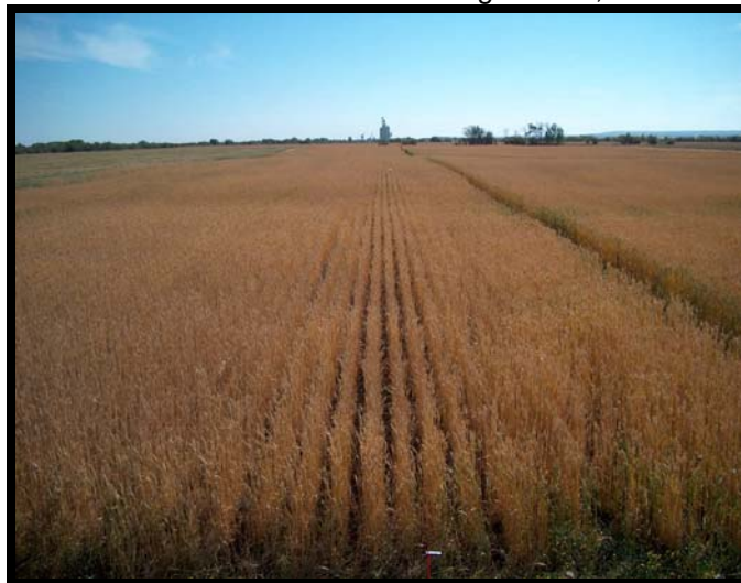
Above: The 80-0-0-0 treatment on August 22 nd , 2006.