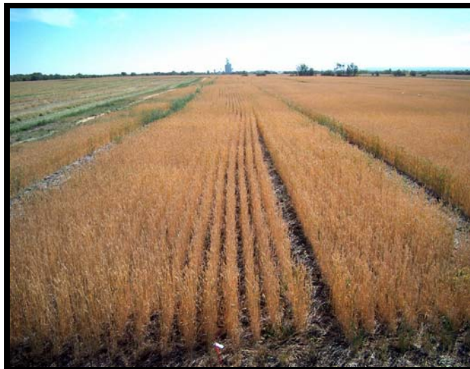
Above: The 40-0-0-0 treatment on August 22 nd , 2006.

The plots were swathed on August 22 nd and combined on September 17 th . The strips were weighed with a weigh wagon and samples were retained to determine % dockage, % moisture and grade. The results are given in Table 25.9 and Figure 25.1.