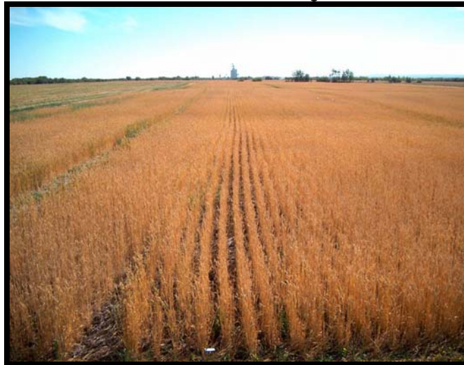
Above: The 0-0-0-0 treatment on August 22 nd , 2006.