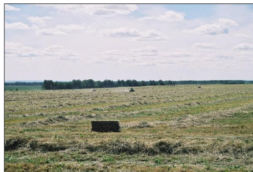
Timothy hay harvested for compressed hay market

Timothy seed is the major exception to the production and supply picture in the Peace. A lot of seed has been harvested the past year, and many fields remain in production. 2014 saw a better than expected crop harvested, as the region encountered dry conditions and pest problems. Despite record Canadian timothy seed exports, supply still far exceeded demand resulting in timothy seed prices falling from average quotes of 61 ¢/lb. (common) to 74 ¢/lb.