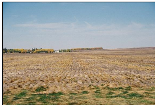
Creeping red fescue rejuvenation (plowing)

Creeping red fescue prices continue to climb, with current quotes in the 80 to 82 ¢/lb. Quotes are up 10 ¢/lb. since last winter (13/14), as the 2015 USA turf seed crop was below average, the Canadian dollar fell to recent lows, and production in the Peace continues to dwindle. Seed movement was average this past winter, despite the poor US crop. With dry conditions throughout most of the Peace region last year, establishment of new fields was poor.