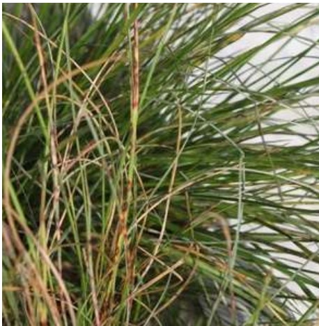
Figure 1. Anthracnose on creeping red fescue leaves