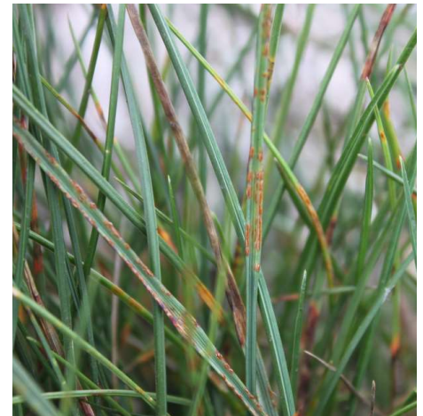
Figure 3. Rust on creeping red fescue plant in the fall

The Seed Head is published by Peace Region Forage Seed Association