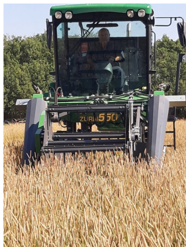
Swathing timothy trials (2022)