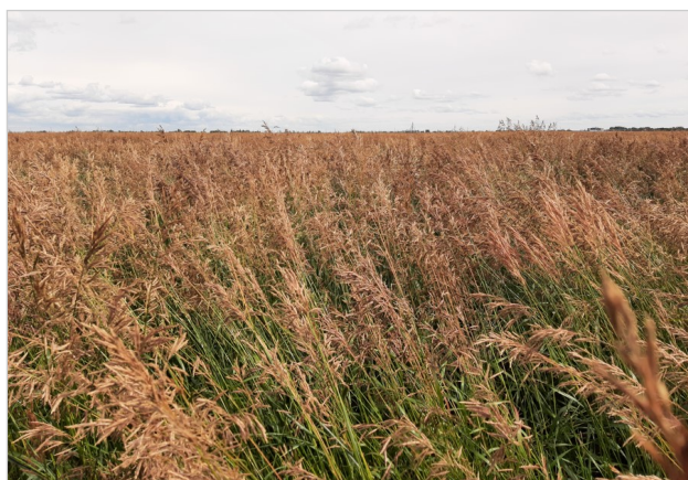
Smooth bromegrass seed field

Infinity (pyrasulfotole+bromoxynil) is a Bayer Crop Sciences herbicide for broadleaf weed control in cereal crops. There are several URMULE for the use of Infinity on both seedling and established grasses grown for seed including creeping red fescue, timothy, bromegrasses and perennial ryegrass. Bayer Crop Sciences added