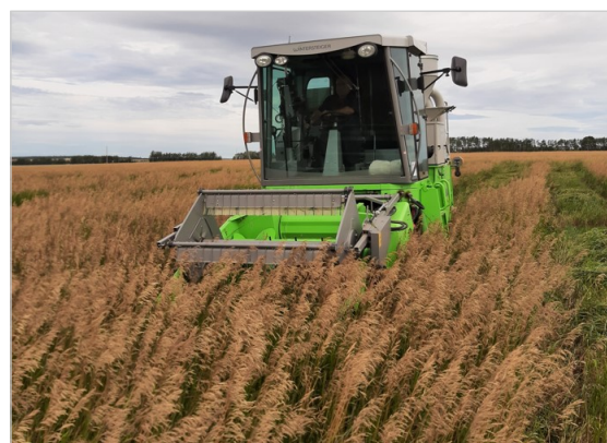
Herbicide tolerance trial on established smooth bromegrass in Alberta (2019).

Tables 4, 5 and 6 show results from three trials evaluating the effects of Infinity FX and Infinity FX+MCPA Ester on smooth bromegrass seed crops. Figure 1 summarizes yields from treatments as