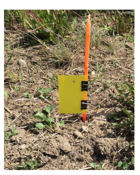
Sticky card used for flea beetle monitoring

Monitoring for flea beetle species began June 3, 2016. Three flee beetle monitoring locations were set up in canola fields throughout the BC Peace; Flatrock (River Crest Farms), Doe River (Doe Creek Farms) and Tower Lake (Critcher Farms). Jennifer Otani's pest montioring program at AAFC Beaverlodge also has two locations: one in Baldonnel and one in RollaTwo striped flea beetles are still the predominate species found on the sticky cards in the first week. Fields were inspected for damage however due to the excellent growing and moisture conditions that the sites currently have there was minimal damage to the canola seedlings.