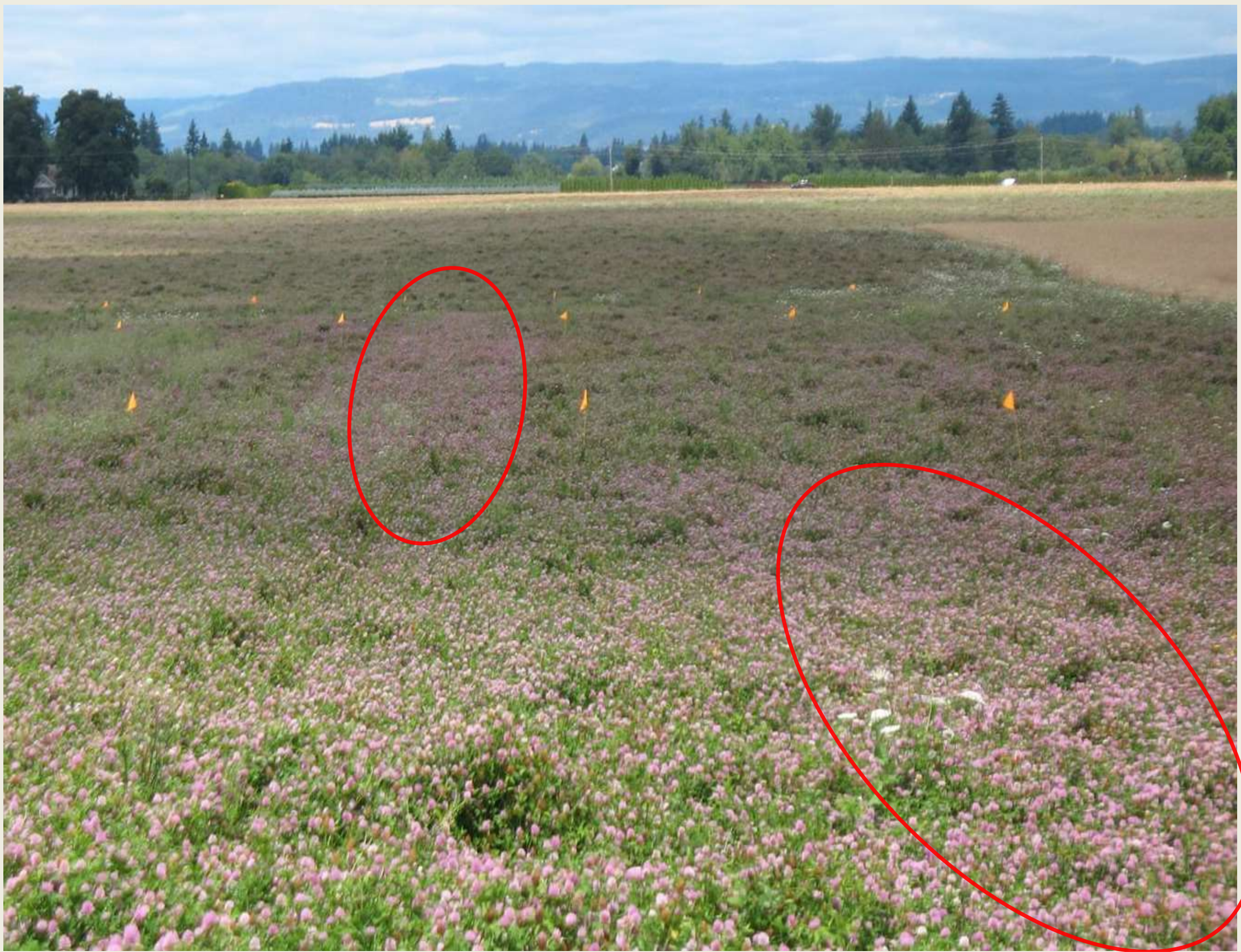
Figure 1. Marked areas show increased seed head density following TE applications.

Large scale on-farm trials were conducted on 8 commercial red clover fields from 2010-2012. Plots were arranged in randomized complete blocks with three replications. Each plot was 6 m or 7.6 m wide by 91.4 m long. Five rate and timing combinations were used to determine the effect of TE. Treatments consisted of 250 g ai ha -1 TE (Stem E 250) and 500 g ai ha -1 TE (Stem E 500) applied at stem elongation (BBCH scale 32), TE applied at bud emergence stage (BBCH scale 50) at 250 g ai ha -1 (Bud E 250), 250 g ai ha -1 TE applied at both timings (Split 500), and an untreated control. In all years, seed yield and weight were measured, while inflorescence and floret counts, and canopy height measurements were made in 2011 and 2012.